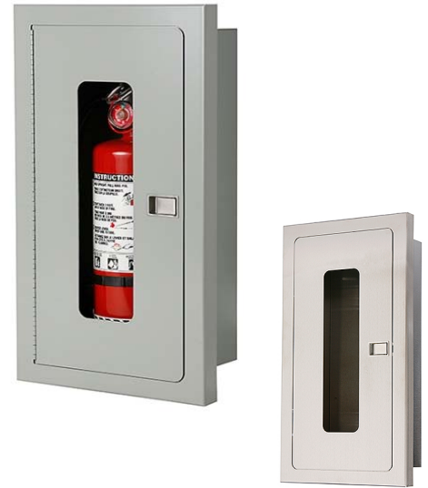
EC-112 (Stainless Steel)